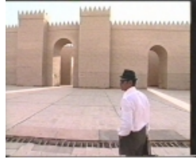
A professional mendicant acts as curator for the Babylon site now under construction.

Saddam Hussein would like his multi-talented qualities to be recognized by all. He believes he has all the qualities necessary for a world dictator. He's an accomplished murderer and a liar and a self-serving egotist. If that's not good enough, he feels that his physical likeness to Nebuchadnezzar should make him a shoe-in. He offers the following evidence: