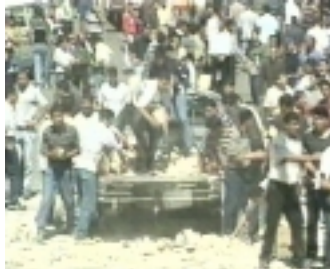
Media scrum footage. They cart in stones to throw and bottles to make Molotov cocktails. The guns are hidden out of sight.