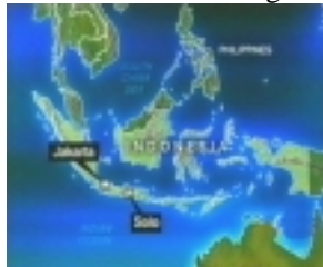
Map of Indonesia – the most populous Muslim nation.

In the City of Solo, close to Jakarta, Muslim hordes terrorized the streets, demanding that all Americans leave within 24 hours. The U.S. has ordered the U.S. embassy in Jakarta to close, and evacuate. They've also advised all Americans to stay out of the country. They've warned that all Muslim countries are now considered high-risk areas.