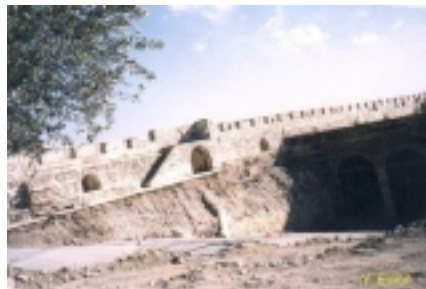
Excavations right up to the perimeter wall has been done, hollowing out the underground cavernous site for a new mosque. It seems peace is more important than the sacred things of Almighty God!

Although the Palestinians were given access to the Templemount in 1968, Israel retained jurisdiction over the site. This is also true of the West Bank and Gaza. The Moslems demanded that the Jewish people be barred access to the Templemount, and the Israeli police, so as not to inflame the Moslems, has unofficially enforced this. Any type of work that is done on the Holy Mount is supposed to be approved by Israeli authorities. According to reliable sources, the only approval given for the new mosque developments was given verbally by Ehud Barak, and in circumstances cloaked in secrecy. The Moslems actually demand permits even from Israeli authorities to visit the site of the desecration.