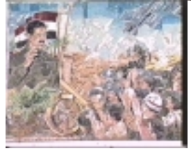
And always the great hero!

He can't understand why the rest of Islam don't recognize him as the great saviour and prophet. He needs something to propel him to hero stature in the eyes of all his peers. Fighting the U.S. is not an option! He tried that and failed. But a more modest target is Israel. He seeks an opportunity to flex his muscles without involving the mightiest power on earth. He reasons that the Palestinian propaganda machine is winning sympathy, while terrorists are being activated to create havoc with bombs and terrorist acts, and putting U.S. personnel on edge.