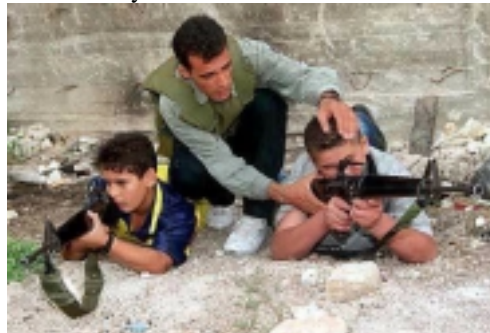
"You're worth $3,000 if you die as martyrs, my sons, so do your duty!"