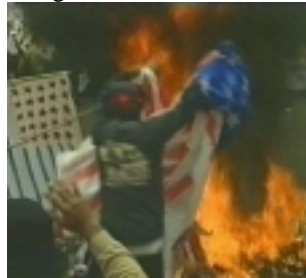
U.S. flags are in short supply in Indonesia. They've all been burnt.