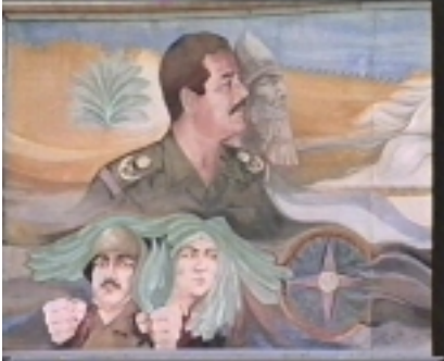
The image behind Saddam is Nebuchadnezzar. Notice the resemblance? The only difference is Nebuchadnezzar didn't pluck his eyebrows or get a permanent wave.

Saddam Hussein would like his multi-talented qualities to be recognized by all. He believes he has all the qualities necessary for a world dictator. He's an accomplished murderer and a liar and a self-serving egotist. If that's not good enough, he feels that his physical likeness to Nebuchadnezzar should make him a shoe-in. He offers the following evidence: