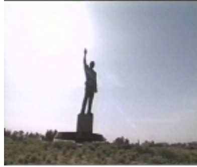
100 foot statue of Saddam giving the two-finger salute to all those who don't like him. All Iraqis love him – or else!!