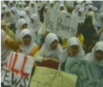
The sign on the left says 'Kill Jews'. The one beside it is a call for Israel's destruction.

It's already begun! On October 30, 2000, Indonesian Muslims took to the streets. Their fanatical madness resulted in burning and destruction. The objects of their hatred were made plain with signs such as 'Kill Jews' and the usual U.S. flag burning.