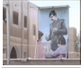
Iraqis can't escape him...