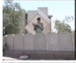
...on every building...