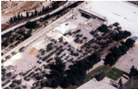
Another aerial view of the construction site, and the decline leading into the underground mosque area.

And the destruction continues, but no-one will stop it! Priceless artifacts, the history of thousands of years, are ripped up and discarded, and no-one cares. The Tribes of Israel have a lot to learn!