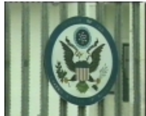
U.S. Embassy sign – the most hated object in the Muslim world.