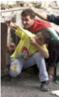
"Shoot for the eyes" he tells his son.

The Palestinians gunned down a rabbi who tried to intervene in the desecration of Joseph's tomb. They have deliberately murdered many Israelis, and what is more, they've deliberately murdered their own people in order to blame the Israelis. The problem is, the media circus seems to want to sanitize everything the Moslems do and find fault only with the Israelis.