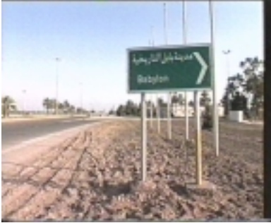
Did you know that the Bible speaks of a signpost to Babylon? (Eze 21:19). It has a lot more to say too, in the same chapter!

Saddam Hussein is not finished yet. In addition to offering his 4,000,000 strong army for the destruction of Israel, he also has a capital city in mind for all Islam. He's been busily building it in preparation for the big event. He's even put up a signpost to show the way.