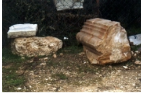
An ornately carved arch is smashed to pieces and discarded like rubbish.

have gotten away with it this time, and if the U.S. has anything to do with it, they'll get away with it next time.