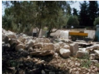
Ancient artifacts are smashed and strewn across the ground on the Temple Mount.