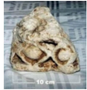
Precious artifacts mean nothing to these people.

And why shouldn't Ariel Sharon want to inspect the sort of vandalism that continues on the Temple Mount? God has a special regard for those who sigh and cry for the disgusting things that are done in Jerusalem.