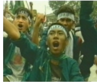
The fanatical faces of Indonesian Muslims as they terrorize all non-Muslims.

In the City of Solo, close to Jakarta, Muslim hordes terrorized the streets, demanding that all Americans leave within 24 hours. The U.S. has ordered the U.S. embassy in Jakarta to close, and evacuate. They've also advised all Americans to stay out of the country. They've warned that all Muslim countries are now considered high-risk areas.