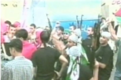
Let's pretend the Palestinians don't have guns! These are terrorist snipers who shoot to kill!

What the media circus has reported throughout this entire conflict in Israel is the perverted view that Palestinians only threw rocks and firebombs. They reported that the Israelis were shooting live rounds of ammunition. Yet almost every piece of footage they showed featured Palestinians with automatic weapons. The amount of live ammunition fired by the Palestinians far exceeded that fired by the Israelis. Unlike the Israelis who fire rubber bullets, the Palestinian terrorists shoot to kill.