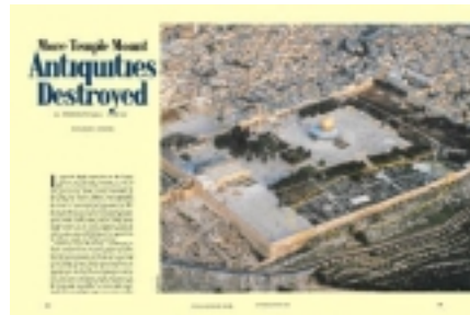
Aerial pictures of the unauthorized vandalism by Moslems on the Temple Mount.