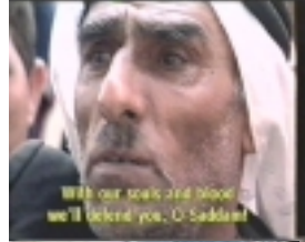
..yet the propaganda is working!