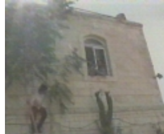
You're supposed to believe the Moslems are the virtuous underdogs. The mutilated body of an Israeli soldier is thrown out of the window of the Ramallah police station.

The Palestinians gunned down a rabbi who tried to intervene in the desecration of Joseph's tomb. They have deliberately murdered many Israelis, and what is more, they've deliberately murdered their own people in order to blame the Israelis. The problem is, the media circus seems to want to sanitize everything the Moslems do and find fault only with the Israelis.