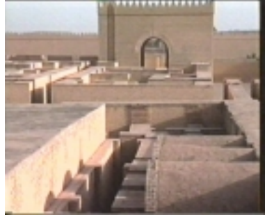
This immense city of Babylon will soon be completed for the task it will fulfill in prophecy.