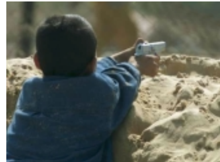
Another trainee martyr – and his father is so pleased.