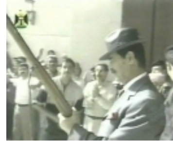
Saddam trying to act tough! The feigned smiles on his admirers are because of the uzzi trained on them (just out of frame). The man just right of center is begging for his life.

Saddam Hussein is a two-bit player, a worthless degenerate who will come to a swift end. His nation will be swallowed up, and the mighty Persian Empire will rise again. You've seen the speed in which things can happen during the month of October, 2000. Those who know their God will also know the chain of events that can occur in a 3½ period ( Rev 12:14 ). There will be strong resistance from those who know their God, but others will have to weather the storm in faithful service to God ( Rev 17:5-6 ).