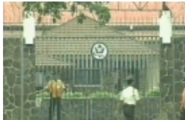
U.S. Embassy in Jakarta closes its gates and staff evacuated.